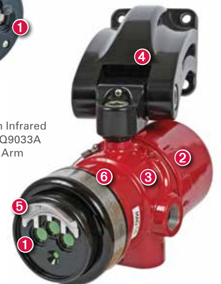
X3301 Multispectrum Infrared Flame Detector with Q9033A Aluminum Mounting Arm