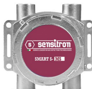
S-MS 2S (SS enclosure)

Sensor heads to be selected among S4, S6, S8